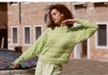
SAVOUR PISTACHIO & ARTICHOKE