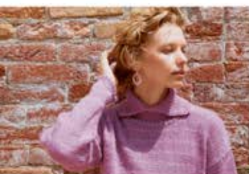
STROLL OLEANDER & BOUGAINVILLEA