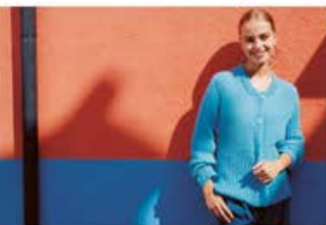
CRUISE LIDO & LAGOON